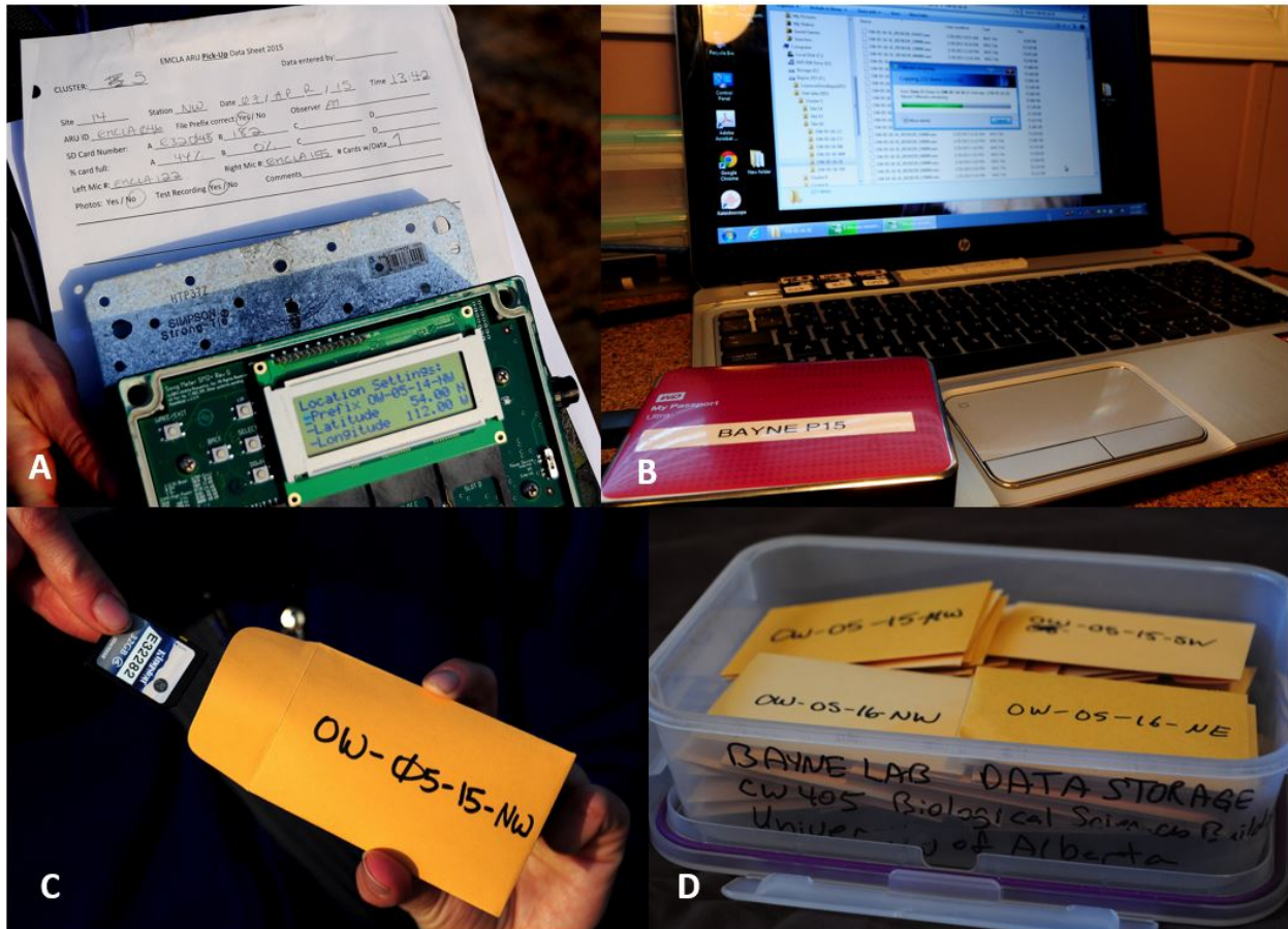
Figure 2. Downloading data. A. Check file prefix on ARU against the data sheet and cross reference using ARU number. B. Copy data from SD card onto back-up hard drive. C. Put SD card into labelled envelope. D. Store cards with data in a clearly labelled secure container.