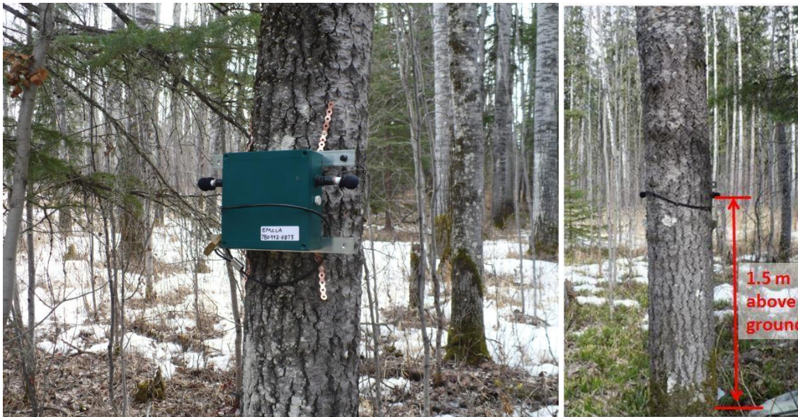
Figure 1. ARU placement on tree. Microphones still are wider than the trunk, thus ensuring that sound is not blocked by the tree. Tree should not be any wider than this one. 4 to 7 inches in diameter is ideal.